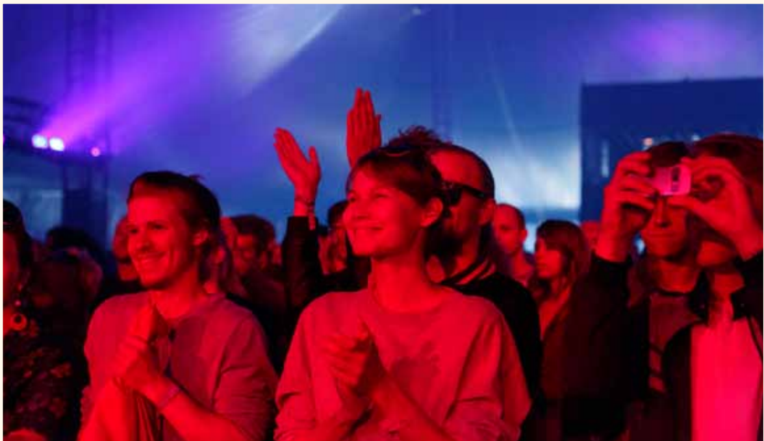
FLOW PHOTO BOOK 2012